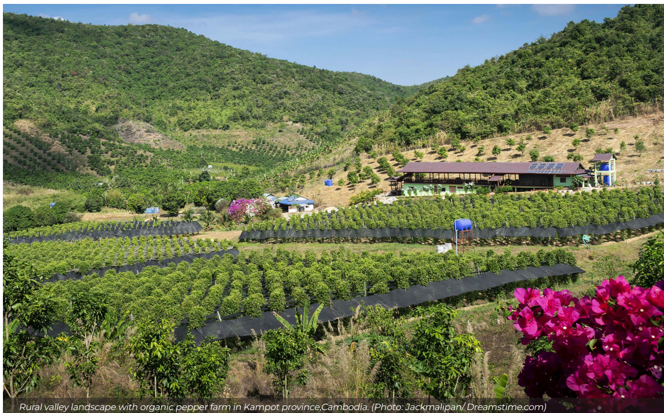
Rural valley landscape with organic pepper farm in Kampot province, Cambodia.