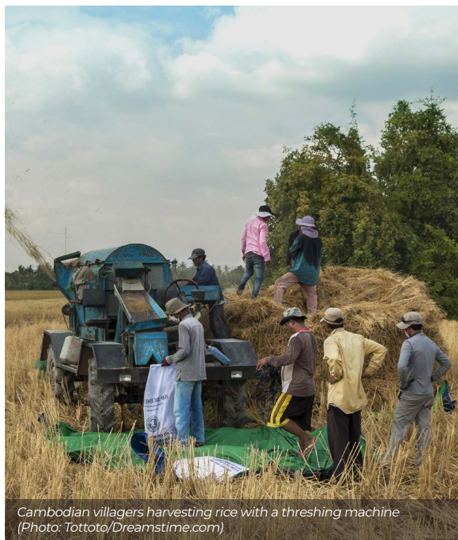
Cambodian villagers harvesting rice with a threshing machine