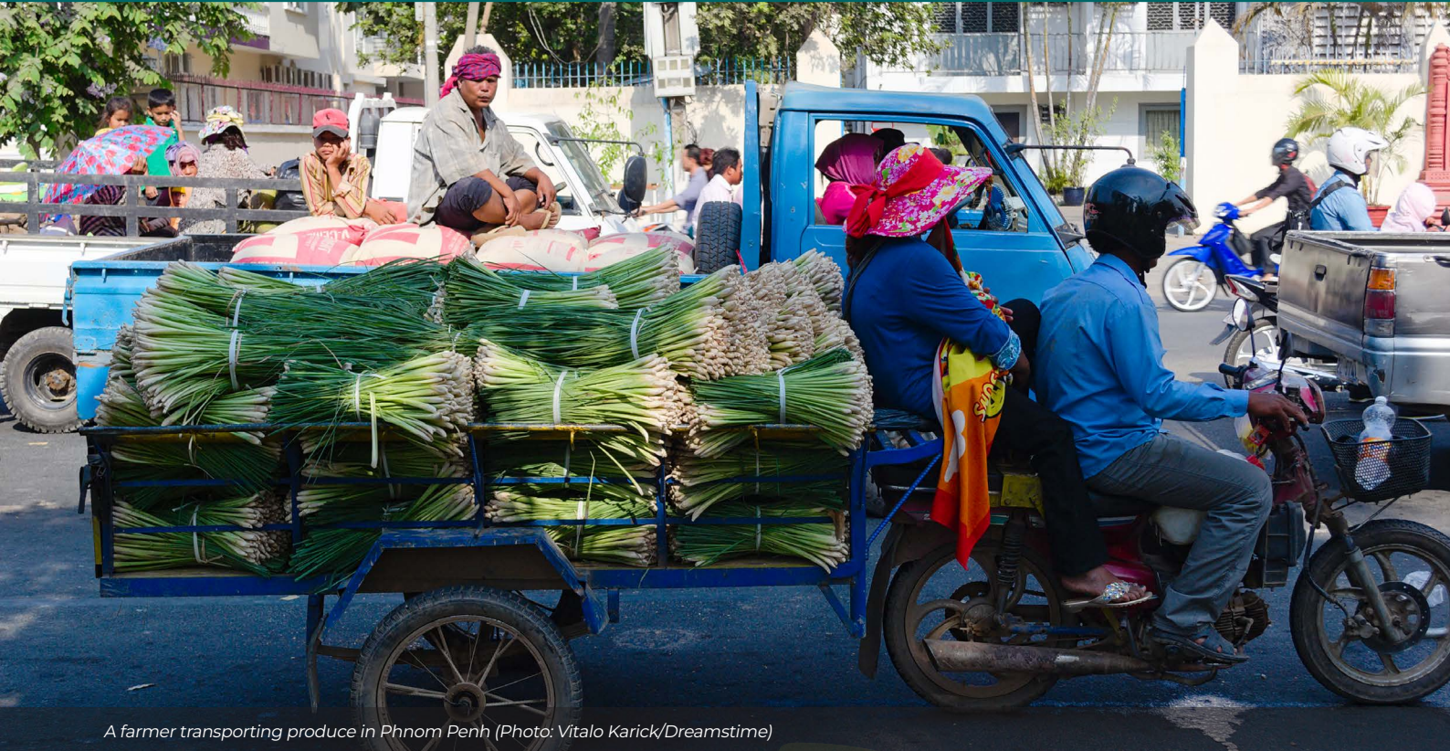
A farmer transporting produce in Phnom Penh