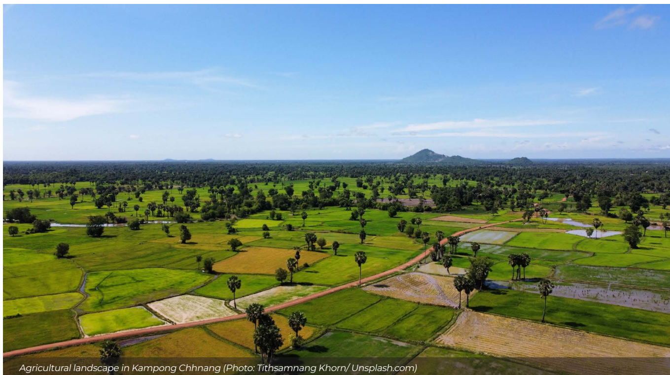
Agricultural landscape in Kampong Chhnang